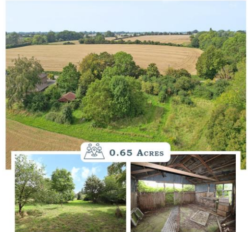
WENHAM LANE, GREAT WENHAM SSTC FOR £150,000