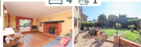
THE STREET, CAPEL ST MARY ASKING PRICE OF £435,000