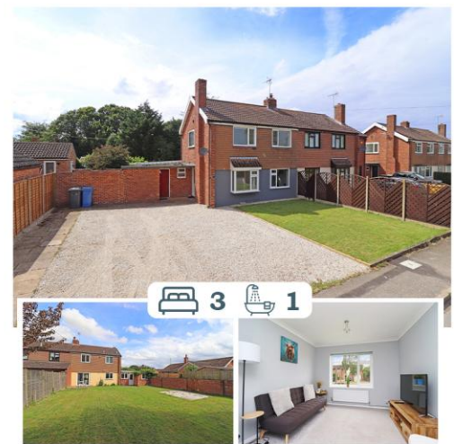
HIGHFIELDS, BENTLEY SSTC FOR £355,000