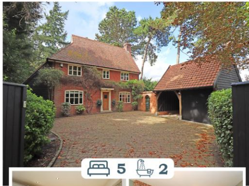
CHURCH LANE, BEAUMONT ASKING PRICE OF £675,000