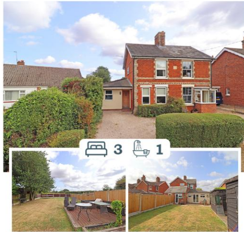
BERGHOLT ROAD, BRANTHAM SSTC FOR £400,000