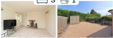
CHAPLIN ROAD, EAST BERGHOLT ASKING PRICE OF £417,500