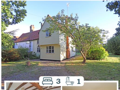
LONG ROAD WEST, DEDHAM SSTC FOR £600,000