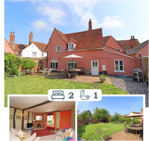
PARK STREET, STOKE-BY-NAYLAND SSTC FOR £445,000