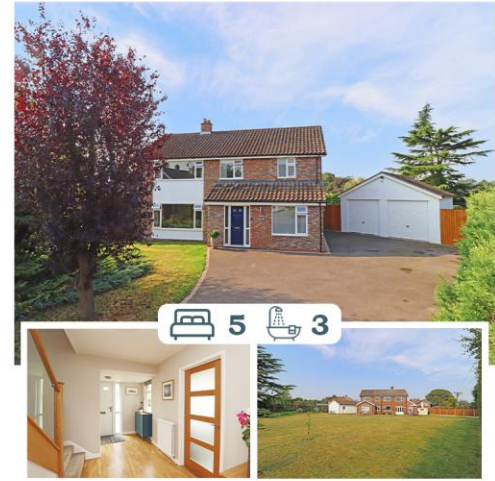
LONDON ROAD, CAPEL ST MARY ASKING PRICE OF £675,000