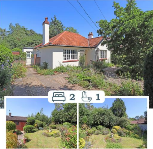
ELM ROAD, EAST BERGHOLT SSTC FOR £295,000