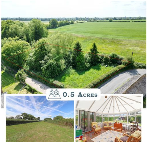
MILL LANE, CAPEL ST. MARY SSTC FOR £60,000