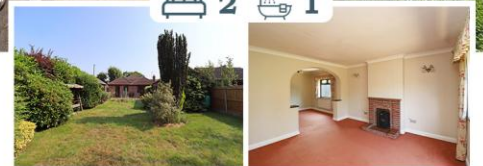
SCHOOL ROAD, LANGHAM ASKING PRICE OF £430,000