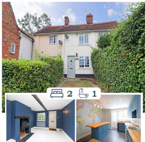
UPPER STREET, LAYHAM SSTC FOR £265,000