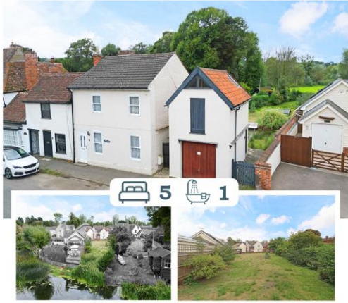
LOWER STREET, STRATFORD ST MARY SSTC FOR £520,000