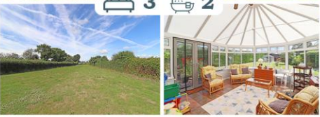
TENDRING ROAD, STONES GREEN ASKING PRICE OF £695,000