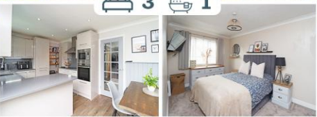
FRIARS, CAPEL ST MARY ASKING PRICE OF £355,000