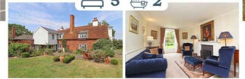
HARWICH ROAD, BEAUMONT ASKING PRICE OF £675,000