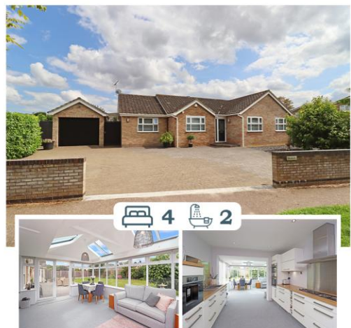
EAST MILL GREEN, BENTLEY ASKING PRICE OF £495,000