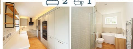
HEATH ROAD, EAST BERGHOLT ASKING PRICE OF £415,000