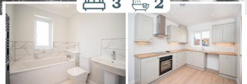
PRIOR GARDENS PRICES FROM £330,000