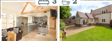
LONG MEADOW, COPDOCK ASKING PRICE OF £475,000